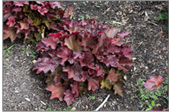
Carnival Burgundy Blast Coral Bells

Carnival Burgundy Blast Coral Bells is a fine choice for the garden, but it is also a good selection for planting in outdoor pots and containers. It is often used as a 'filler' in the 'spiller-thriller-filler' container combination, providing a mass of flowers and foliage against which the larger thriller plants stand out. Note that when growing plants in outdoor containers and baskets, they may require more frequent waterings than they would in the yard or garden.