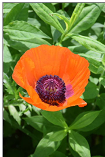
Prince Of Orange Poppy flowers

Prince Of Orange Poppy is recommended for the following landscape applications;