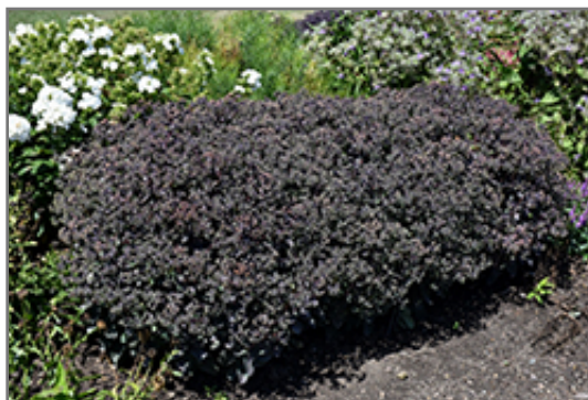
Night Light Stonecrop in bloom

Night Light Stonecrop is recommended for the following landscape applications;