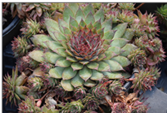
Chick Charms Butterscotch Baby Hens And Chicks

This plant will require occasional maintenance and upkeep, and should not require much pruning, except when necessary, such as to remove dieback. Deer don't particularly care for this plant and will usually leave it alone in favor of tastier treats. Gardeners should be aware of the following characteristic(s) that may warrant special consideration;