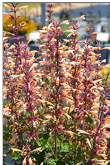
Meant To Bee Queen Nectarine Anise Hyssop flowers

Meant To Bee Queen Nectarine Anise Hyssop is recommended for the following landscape applications;