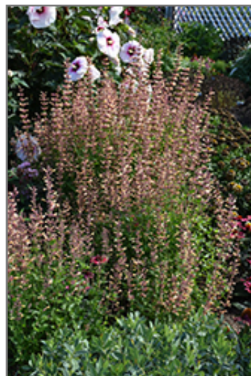
Meant To Bee Queen Nectarine Anise Hyssop in bloom

Meant To Bee Queen Nectarine Anise Hyssop is a fine choice for the garden, but it is also a good selection for planting in outdoor pots and containers. With its upright habit of growth, it is best suited for use as a 'thriller' in the 'spiller-thriller-filler' container combination; plant it near the center of the pot, surrounded by smaller plants and those that spill over the edges. It is even sizeable enough that it can be grown alone in a suitable container. Note that when growing plants in outdoor containers and baskets, they may require more frequent waterings than they would in the yard or garden.