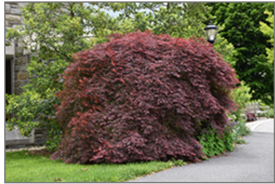
Tamukeyama Japanese Maple

Tamukeyama Japanese Maple will grow to be about 7 feet tall at maturity, with a spread of 10 feet. It tends to be a little leggy, with a typical clearance of 3 feet from the ground, and is suitable for planting under power lines. It grows at a slow rate, and under ideal conditions can be expected to live for 80 years or more.