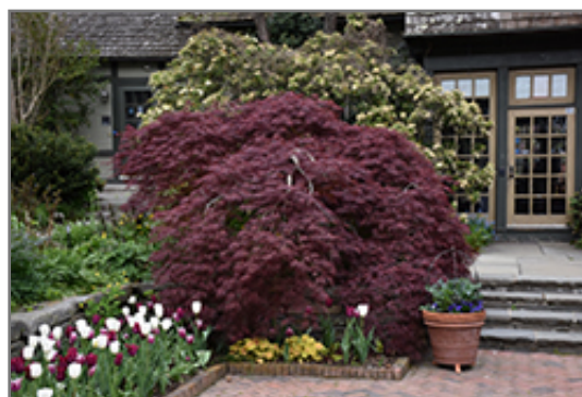
Tamukeyama Japanese Maple

Tamukeyama Japanese Maple is recommended for the following landscape applications;