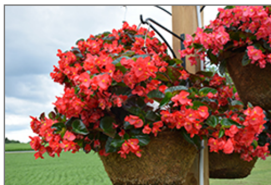
Viking Explorer Red on Green Begonia in bloom