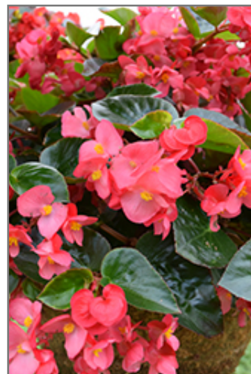
Viking Explorer Rose on Green Begonia flowers

This plant will require occasional maintenance and upkeep, and usually looks its best without pruning, although it will tolerate pruning. Deer don't particularly care for this plant and will usually leave it alone in favor of tastier treats. It has no significant negative characteristics.