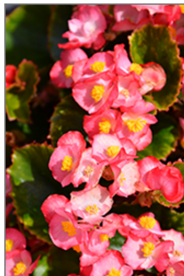
Ambassador Rose Blush Begonia flowers