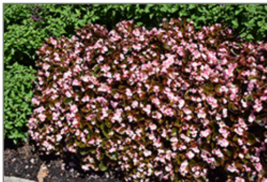
Cocktail Brandy Begonia in bloom