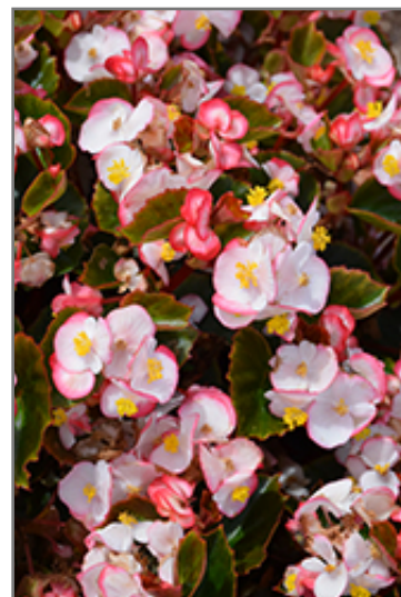
Cocktail Rum Begonia flowers