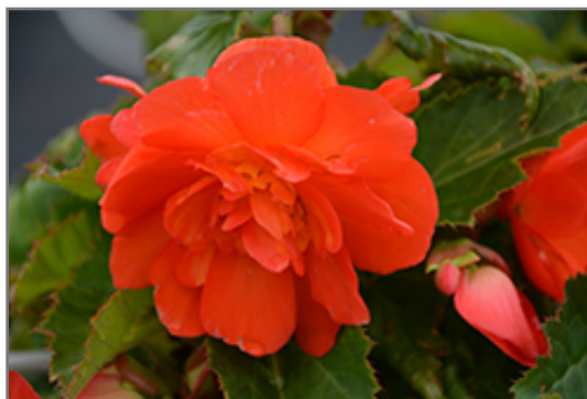
Nonstop Sunset Begonia flowers

Nonstop Sunset Begonia is recommended for the following landscape applications;