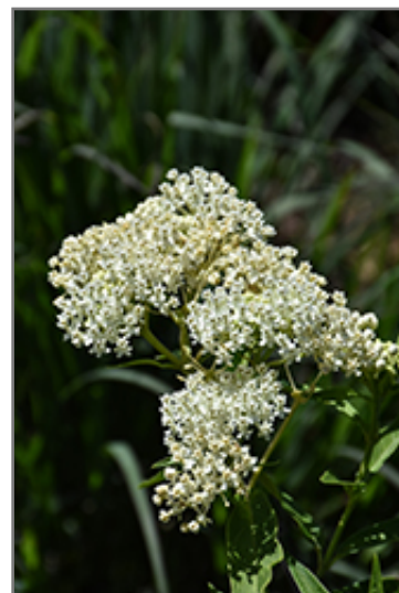
Ice Ballet Milkweed flowers