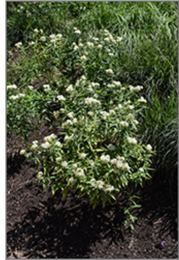
Ice Ballet Milkweed in bloom

This plant does best in full sun to partial shade. It is quite adaptable, preferring to grow in average to wet conditions, and will even tolerate some standing water. It is not particular as to soil type or pH. It is quite intolerant of urban pollution, therefore inner city or urban streetside plantings are best avoided. This is a selection of a native North American species. It can be propagated by division; however, as a cultivated variety, be aware that it may be subject to certain restrictions or prohibitions on propagation.