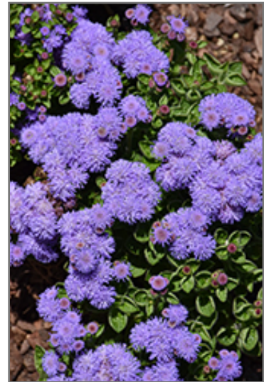
Bumble Blue Flossflower flowers

Bumble Blue Flossflower is a fine choice for the garden, but it is also a good selection for planting in outdoor containers and hanging baskets. It is often used as a 'filler' in the 'spiller-thriller-filler' container combination, providing a mass of flowers against which the thriller plants stand out. Note that when growing plants in outdoor containers and baskets, they may require more frequent waterings than they would in the yard or garden.