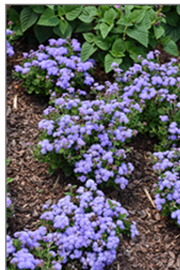
Bumble Blue Flossflower in bloom