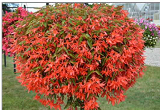
Beauvillia Dark Salmon Begonia in bloom