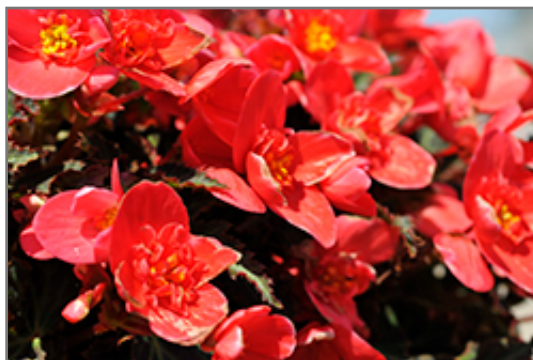
I'Conia First Kiss Begonia flowers

I'Conia First Kiss Begonia is recommended for the following landscape applications;