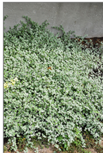
Silver Licorice Plant

Silver Licorice Plant is a fine choice for the garden, but it is also a good selection for planting in outdoor containers and hanging baskets. Because of its trailing habit of growth, it is ideally suited for use as a 'spiller' in the 'spiller-thriller-filler' container combination; plant it near the edges where it can spill gracefully over the pot. Note that when growing plants in outdoor containers and baskets, they may require more frequent waterings than they would in the yard or garden.