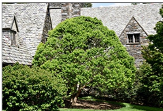
Fox Valley River Birch