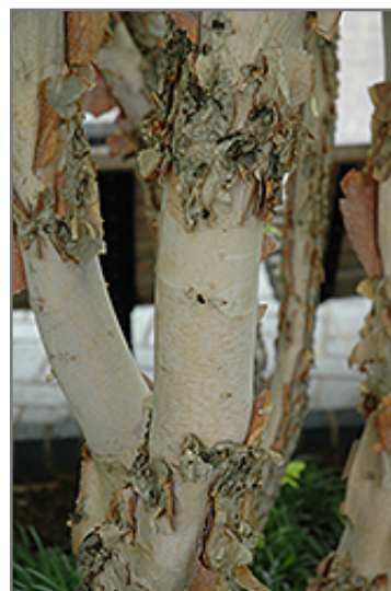
Fox Valley River Birch bark