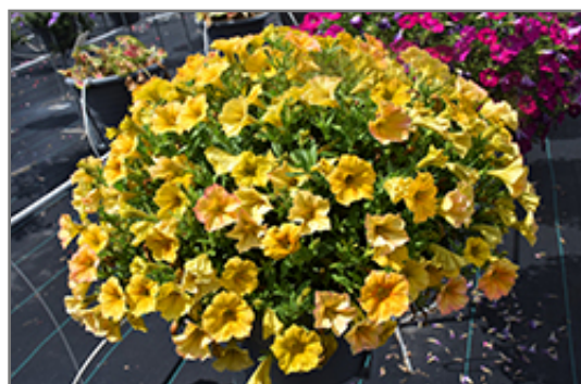
SuperCal Premium Yellow Sun Petchoa in bloom