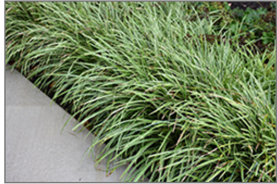
Ice Dance Sedge

Ice Dance Sedge will grow to be about 12 inches tall at maturity, with a spread of 15 inches. Its foliage tends to remain dense right to the ground, not requiring facer plants in front. It grows at a medium rate, and under ideal conditions can be expected to live for approximately 10 years. As an evergreen perennial, this plant will typically keep its form and foliage year-round.