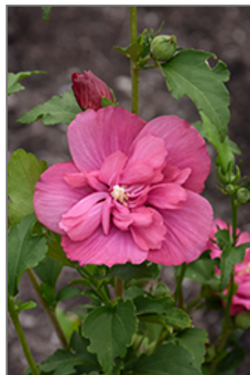
Magenta Chiffon Rose Of Sharon flowers

Magenta Chiffon Rose Of Sharon is recommended for the following landscape applications;