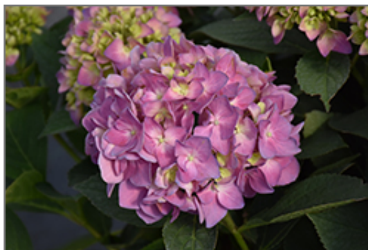
Let's Dance Sky View Hydrangea flowers