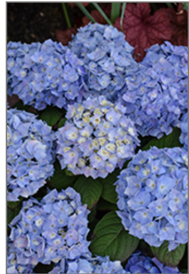
Let's Dance Sky View Hydrangea flowers

Let's Dance Sky View Hydrangea makes a fine choice for the outdoor landscape, but it is also well-suited for use in outdoor pots and containers. Because of its height, it is often used as a 'thriller' in the 'spiller-thriller-filler' container combination; plant it near the center of the pot, surrounded by smaller plants and those that spill over the edges. It is even sizeable enough that it can be grown alone in a suitable container. Note that when grown in a container, it may not perform exactly as indicated on the tag - this is to be expected. Also note that when growing plants in outdoor containers and baskets, they may require more frequent waterings than they would in the yard or garden.