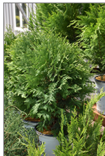
Cheer Drops Arborvitae

This interesting, tall evergreen shrub features an attractive tear drop shape that requires no pruning, and fresh, bright green foliage that stays that way year-round; creates impressive, architectural hedges and foundation plantings