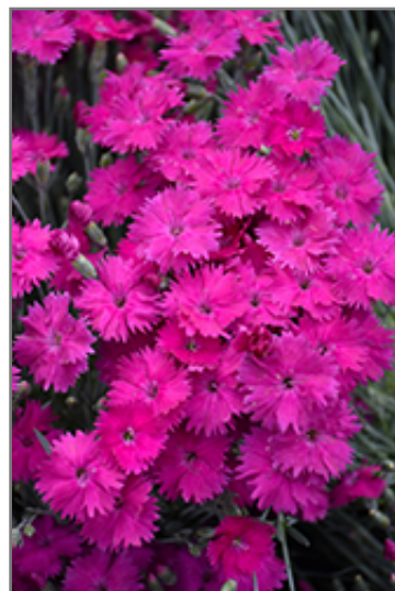
Neon Star Pinks flowers

Neon Star Pinks is recommended for the following landscape applications;