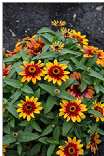
Profusion Red Yellow Bicolor Zinnia flowers