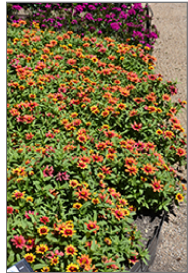
Profusion Red Yellow Bicolor Zinnia in bloom

Profusion Red Yellow Bicolor Zinnia is a fine choice for the garden, but it is also a good selection for planting in outdoor containers and hanging baskets. It is often used as a 'filler' in the 'spiller-thriller-filler' container combination, providing a mass of flowers against which the larger thriller plants stand out. Note that when growing plants in outdoor containers and baskets, they may require more frequent waterings than they would in the yard or garden.