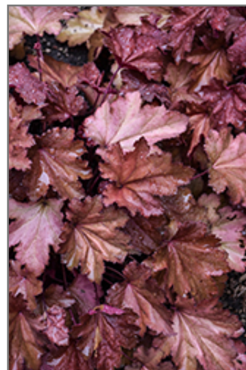
Magma Coral Bells foliage

Magma Coral Bells is recommended for the following landscape applications;