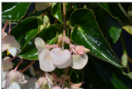
Dragon Wing White Begonia flowers