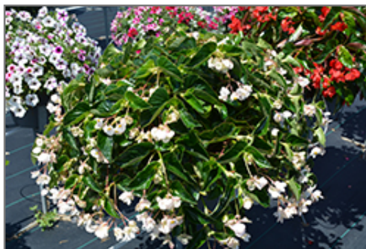
Dragon Wing White Begonia in bloom

This is a high maintenance plant that will require regular care and upkeep, and usually looks its best without pruning, although it will tolerate pruning. Deer don't particularly care for this plant and will usually leave it alone in favor of tastier treats. Gardeners should be aware of the following characteristic(s) that may warrant special consideration;