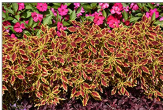
FlameThrower Serrano Coleus