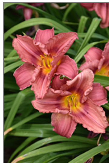
Happy Ever Appster Rosy Returns Daylily flowers

This is a relatively low maintenance plant, and is best cleaned up in early spring before it resumes active growth for the season. It is a good choice for attracting butterflies to your yard. It has no significant negative characteristics.