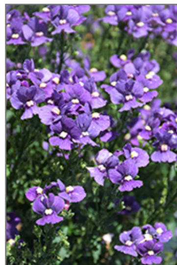
Nesia Denim Nemesia flowers