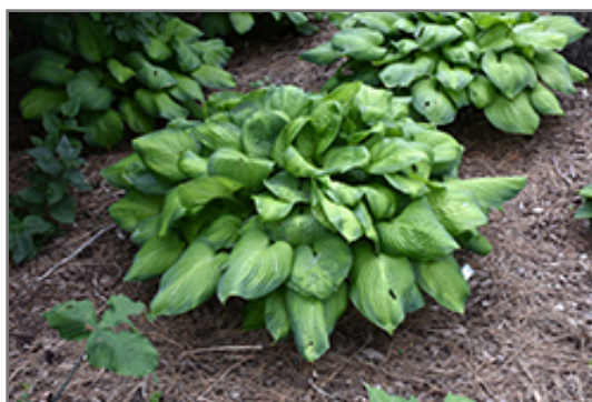
Guacamole Hosta