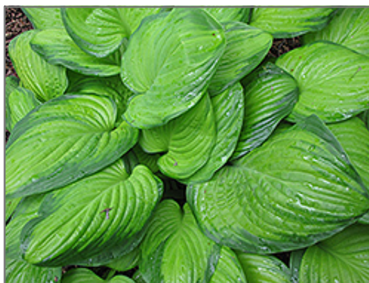
Guacamole Hosta foliage