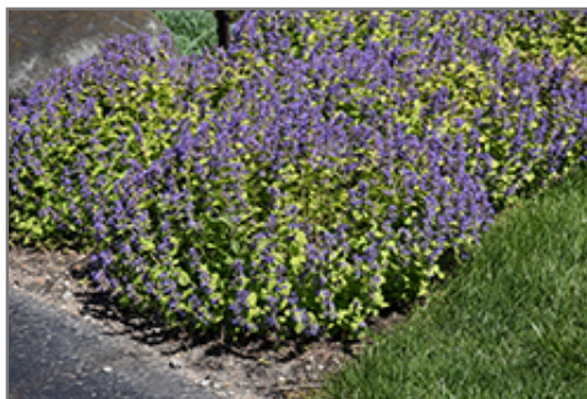
Chartreuse On The Loose Catmint in bloom