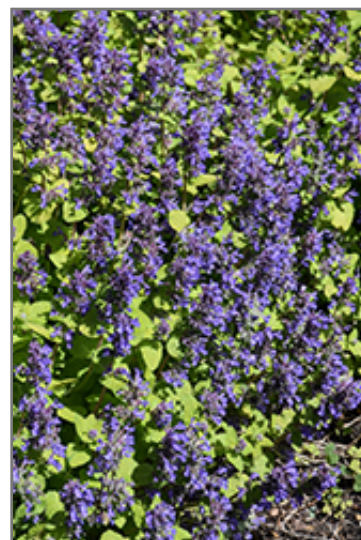
Chartreuse On The Loose Catmint flowers