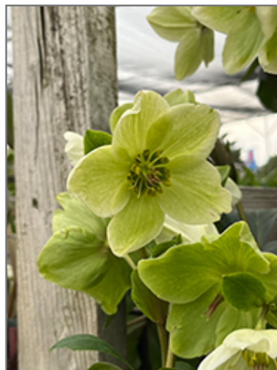
HGC Ice N' Roses White Hellebore flowers

HGC Ice N' Roses White Hellebore is recommended for the following landscape applications;