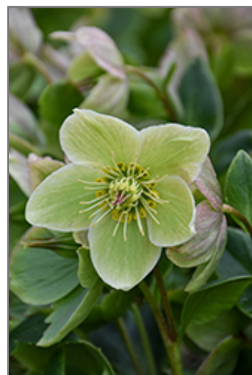
HGC Ice N' Roses White Hellebore flowers