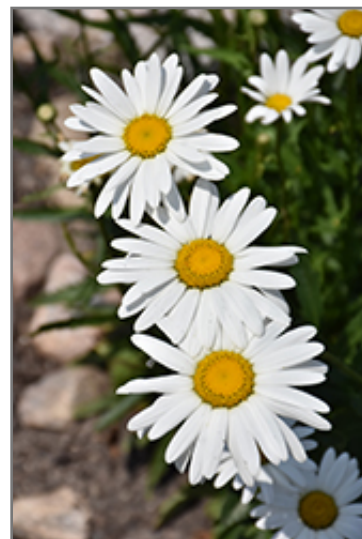
Silver Princess Shasta Daisy flowers