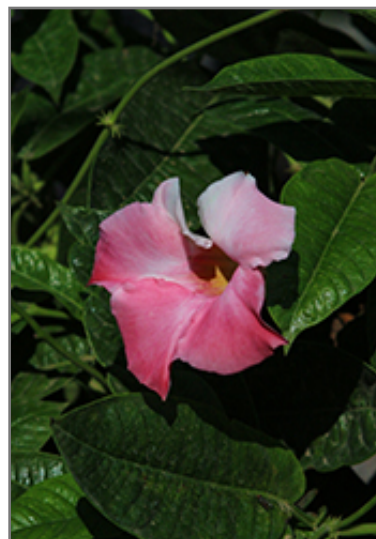
Sun Parasol Giant Dark Pink Mandevilla flowers

This plant does best in full sun to partial shade. It requires an evenly moist well-drained soil for optimal growth. To help this plant achieve its best flowering performance, periodically apply a flower-boosting fertilizer from early spring through into the active growing season. It is not particular as to soil type or pH. It is highly tolerant of urban pollution and will even thrive in inner city environments. This particular variety is an interspecific hybrid, and parts of it are known to be toxic to humans and animals, so care should be exercised in planting it around children and pets. It can be propagated by cuttings; however, as a cultivated variety, be aware that it may be subject to certain restrictions or prohibitions on propagation.