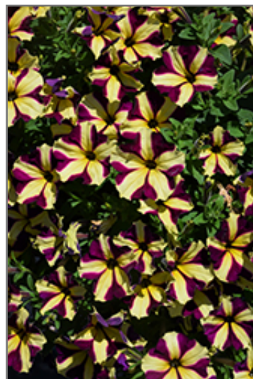
Amore Heart And Soul Petunia flowers

Amore Heart And Soul Petunia is recommended for the following landscape applications;