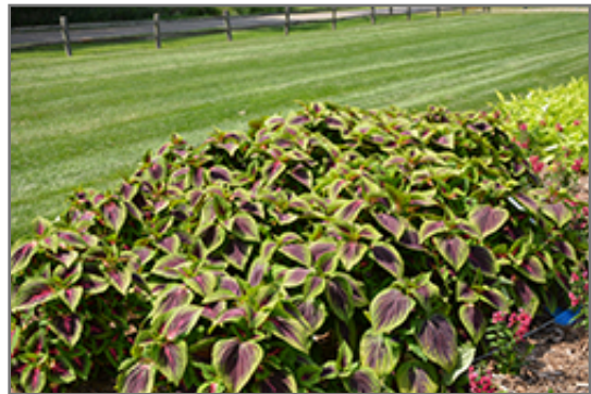
French Quarter Coleus