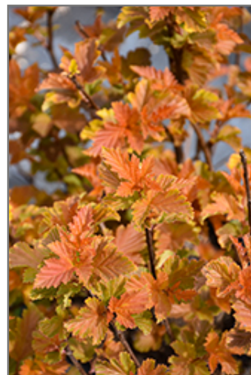
Savannah Sunset Ninebark foliage