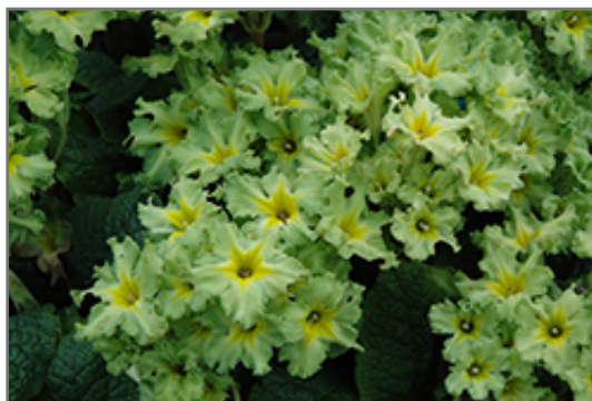
Green Lace Primrose flowers