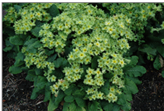
Green Lace Primrose in bloom