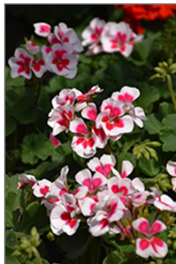
Mojo White Splash Geranium flowers

Mojo White Splash Geranium is recommended for the following landscape applications;