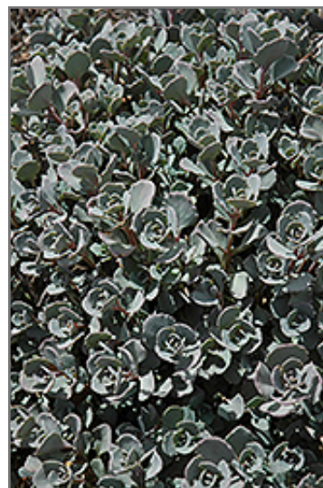
Lidakense Stonecrop foliage