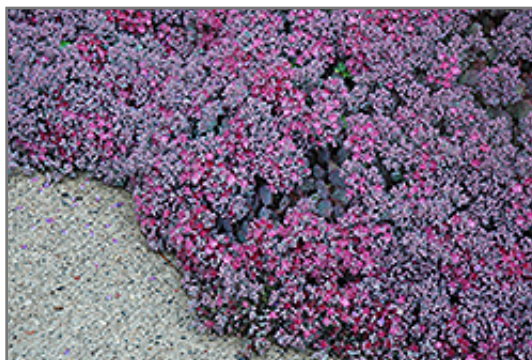
Lidakense Stonecrop in bloom