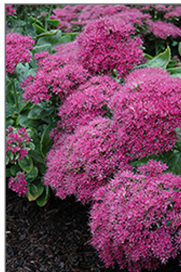
Neon Stonecrop flowers

This is a relatively low maintenance plant, and is best cleaned up in early spring before it resumes active growth for the season. It is a good choice for attracting bees and butterflies to your yard, but is not particularly attractive to deer who tend to leave it alone in favor of tastier treats. It has no significant negative characteristics.