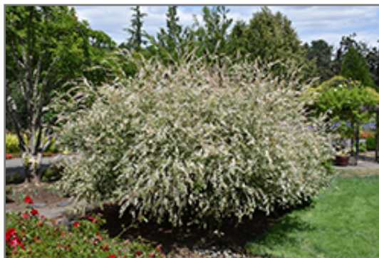
Tricolor Willow