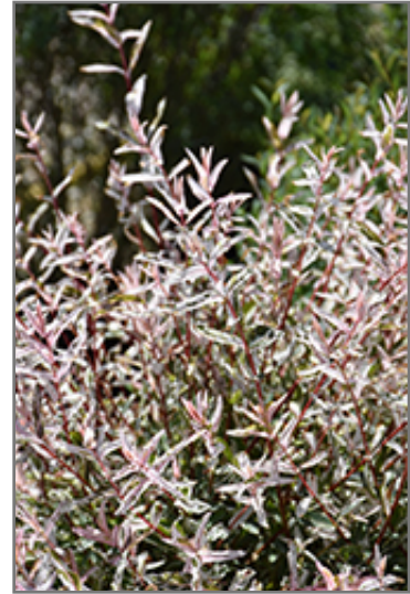
Tricolor Willow foliage

This shrub should only be grown in full sunlight. It is quite adaptable, preferring to grow in average to wet conditions, and will even tolerate some standing water. It is not particular as to soil type or pH. It is highly tolerant of urban pollution and will even thrive in inner city environments. This is a selected variety of a species not originally from North America.