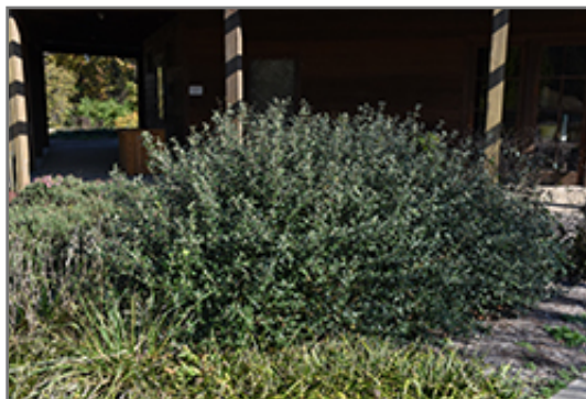
Prague Viburnum