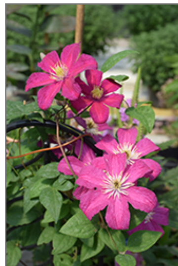
Barbara Harrington Clematis flowers