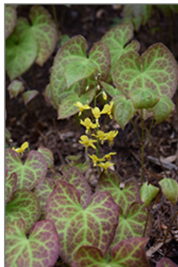
Froehnleiten Bishop's Hat flowers

Froehnleiten Bishop's Hat is a fine choice for the garden, but it is also a good selection for planting in outdoor pots and containers. Because of its spreading habit of growth, it is ideally suited for use as a 'spiller' in the 'spiller-thriller-filler' container combination; plant it near the edges where it can spill gracefully over the pot. Note that when growing plants in outdoor containers and baskets, they may require more frequent waterings than they would in the yard or garden.