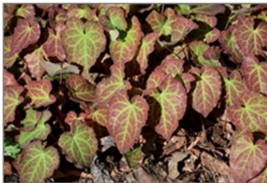
Froehnleiten Bishop's Hat foliage