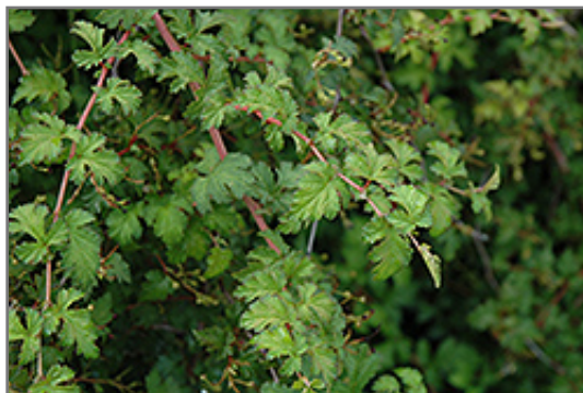
Cutleaf Stephanandra foliage