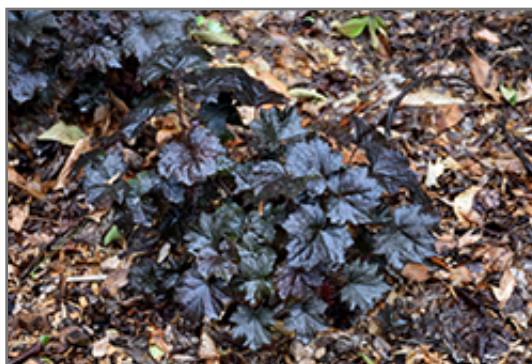
Blackout Coral Bells