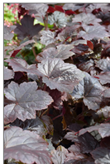
Blackout Coral Bells foliage

Blackout Coral Bells is recommended for the following landscape applications;