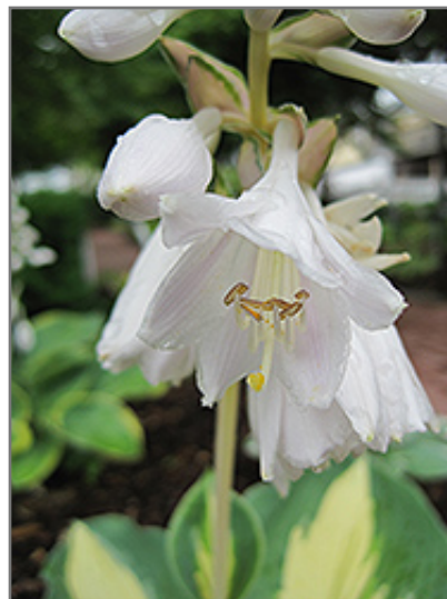
Dream Weaver Hosta flowers