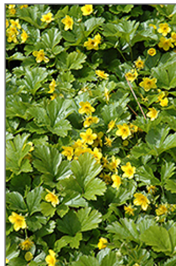
Barren Strawberry flowers

Barren Strawberry is recommended for the following landscape applications;